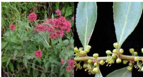
Spur valerian and Chilean mayten.