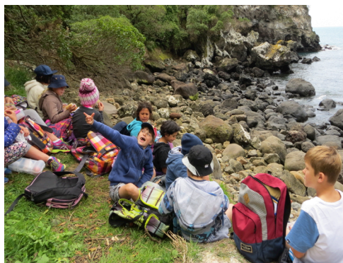
Akaroa Area School visiting Red Bay.

We would be interested in any sightings spur valerian or Chilean mayten (see photos). Spur valerian is currently controlled in Le Bons Bay, on Akaroa coastal cliffs, and is being contained in Akaroa township, with a possible sighting along the BP Track near Flea Bay. It has windblown seeds that quickly form dense stands shading out other plants and is a serious threat to rare native plants on rocky outcrops. Chilean mayten is weed tree that grows to 10m and has seeds dispersed by birds, which can form dense colonies even under shade. Contact Di.Carter@ccc.govt.nz if you spot these weeds or for more information on weed control in your area.