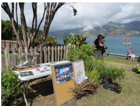
Wildside info at Onuku Waitangi Day